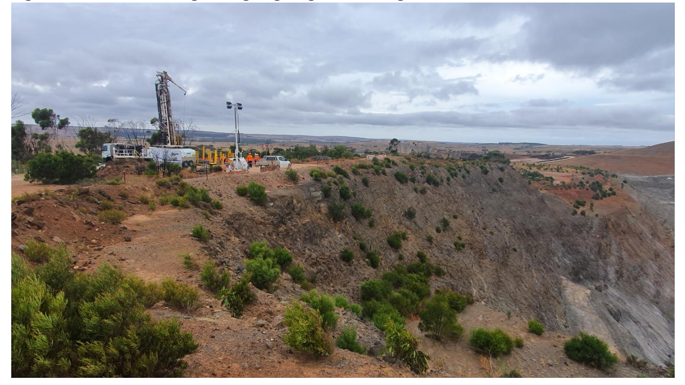
Figure 1 Commencing drilling targeting the Kavanagh lodes below the Giant Pit

The 2020 drilling program successfully intersected a number of high grade Cu-Au zones and the 2021 drill program is aimed to demonstrate the down-dip continuity of the Kavanagh high grade zones (Figure 2) and if successful, to allow a further increase to the Mineral Resource Estimate (which in 2020 more than doubled the total estimated copper metal in the Resources below the open pits<sup>1</sup>). The recent successful placement which resulted in tranche 1 proceeds of $2.4 million being received in December 2020<sup>2</sup> has enabled the Company to confidently fast-track the drilling program.